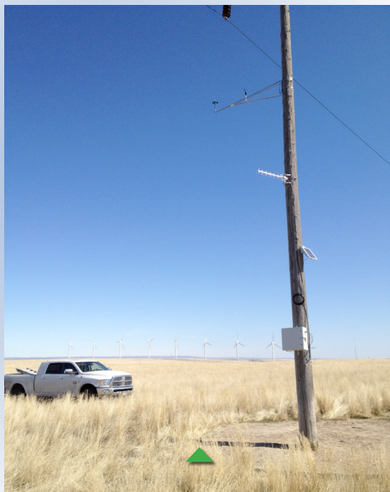
INL researchers and Idaho Power installed more than 40 weather stations along transmission lines in a windy part of southern Idaho's interstate utility corridor.